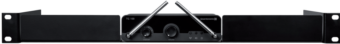
Supplied without receiver